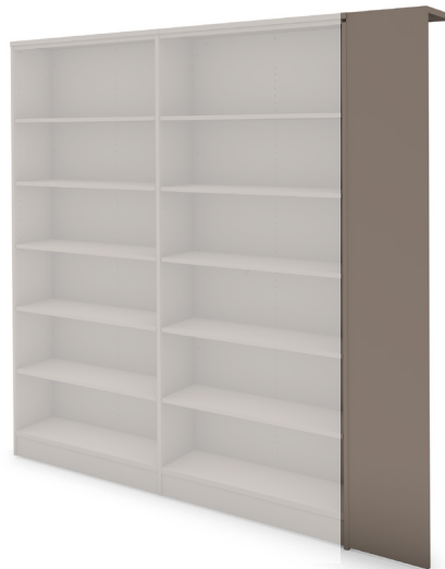
Example of filler being used to fill gap between case and wall. Filler can be field cut for custom fit.