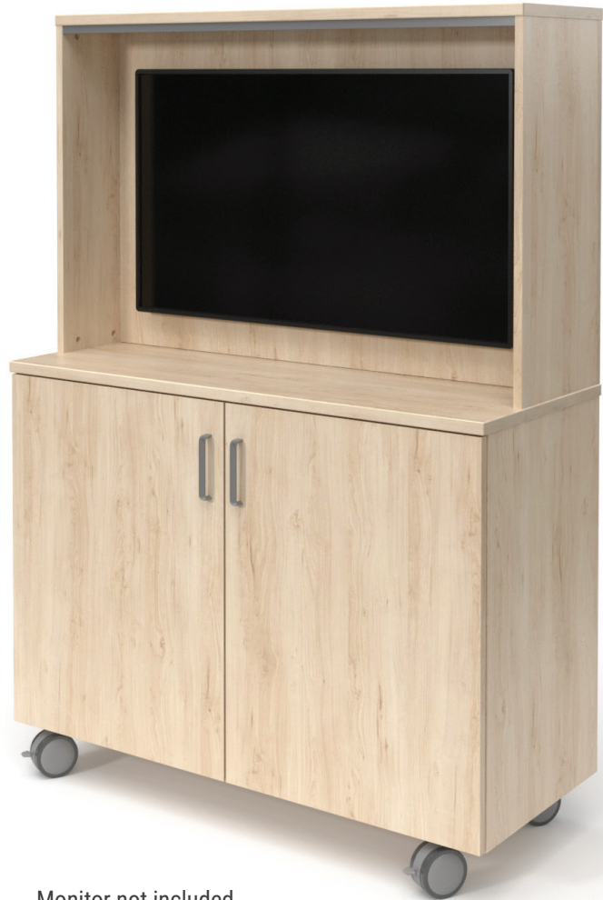
Monitor not included