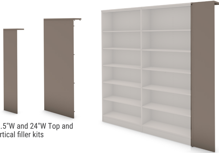
12.5"W and 24"W Top and vertical filler kits

The 12.5" filler kit can also be used for inside corner applications between 2 runs of single sided.