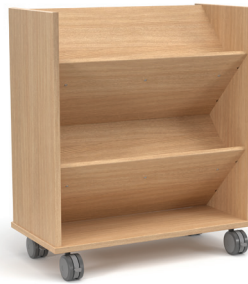
MOBILE BOOK TRUCK