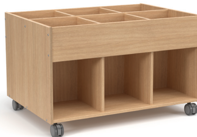
MOBILE BOOK BROWSER 6 Bins