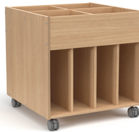
MOBILE BOOK BROWSER 4 Bins