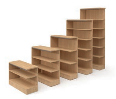
BUILD-UP ADDER BOOKCASE